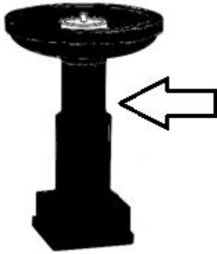
FT-106B (92 lbs) 18.25"W x 25.25" H

Assemble your fountain on a level surface capable of holding a minimum of 134 pounds with an approximate 6 square inch footprint.